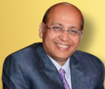
DR. ABHISHEK MANU SINGHVI

SENIOR ADVOCATE SUPREME COURT OF INDIA MEMBER OF PARLIAMENT, INDIA