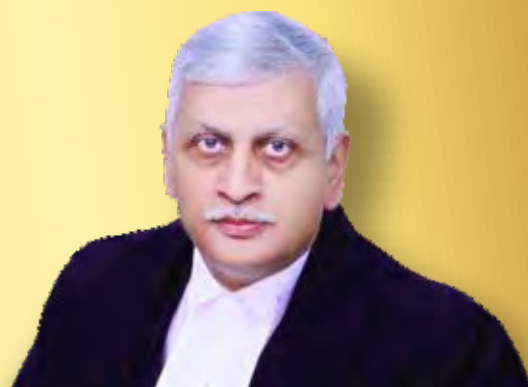
HON'BLE MR. JUSTICE U.U. LALIT