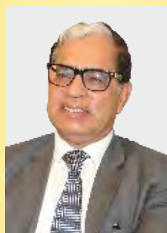
HON'BLE MR. JUSTICE ARJAN SIKRI

DEAN MELBOURNE LAW SCHOOL UNIVERSITY OF MELBOURNE AUSTRALIA